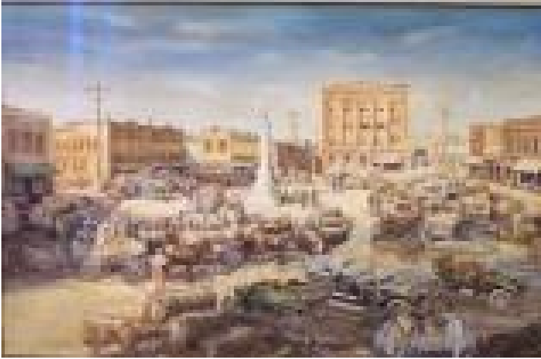
1910 Cotton Sale Adamson Square, Carrollton