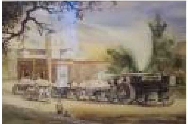
Iron Train on Newnan Street