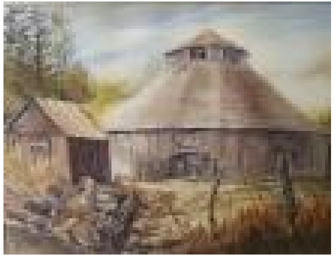
Round Barn, Hickory Level Community